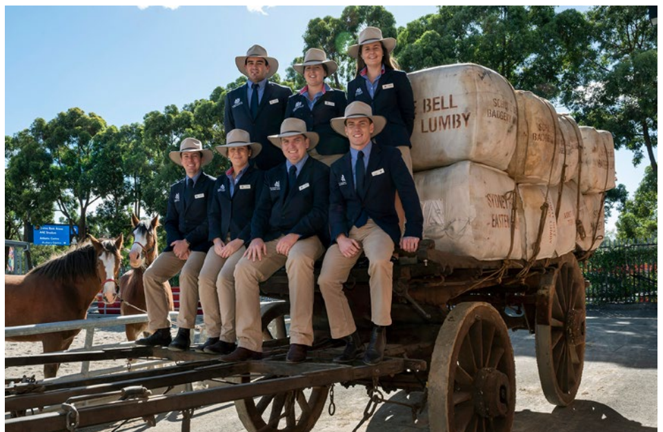
2021 RAS Rural Achiever Award recipients

Akubra was once again proud to support The Land Showgirl Competition and the RAS Rural Achiever Award – a state-wide leadership program run by the Royal Agricultural Society of NSW to recognise future young leaders